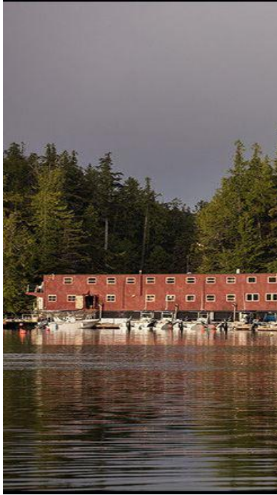
KING PACIFIC LODGE