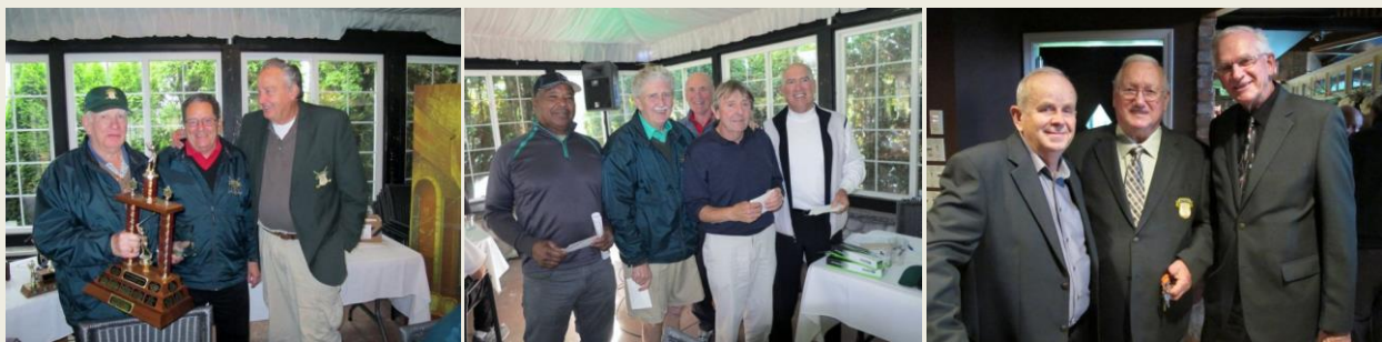
Gentlemen of the Club enjoying the Club House