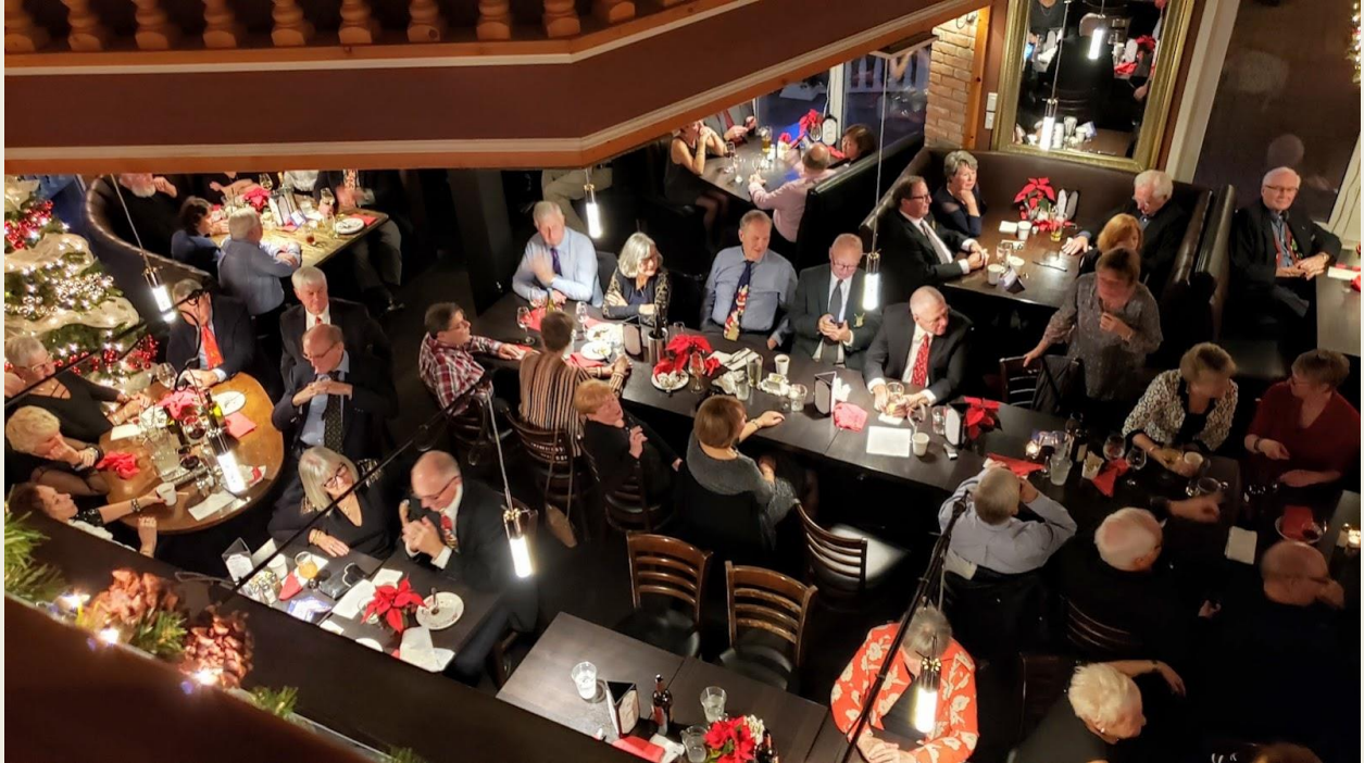
Country Meadows Senior Men's Golf Club