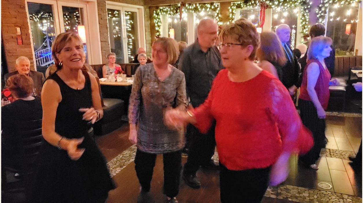
Country Meadows Senior Men's Golf Club