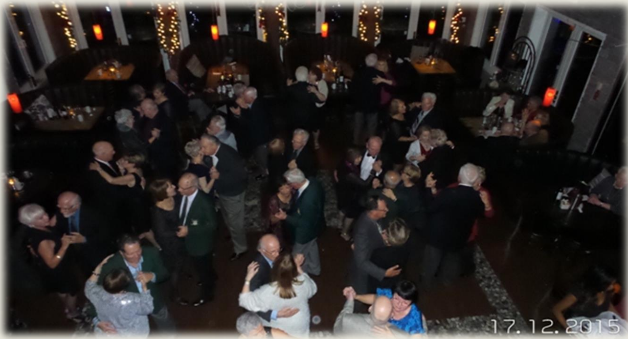
Country Meadows Senior Men's Golf Club