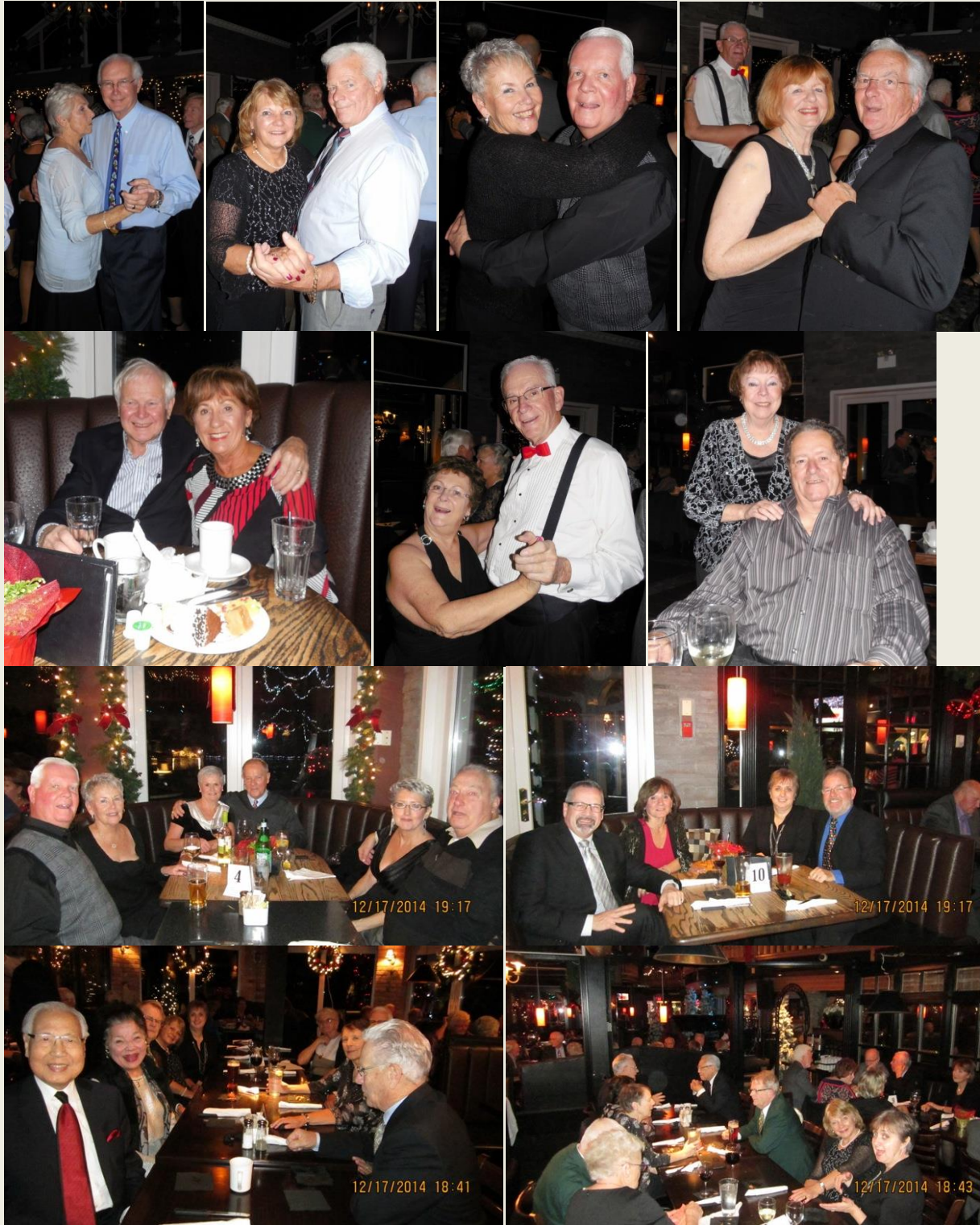
Happy participants at the 2014 Christmas Ball