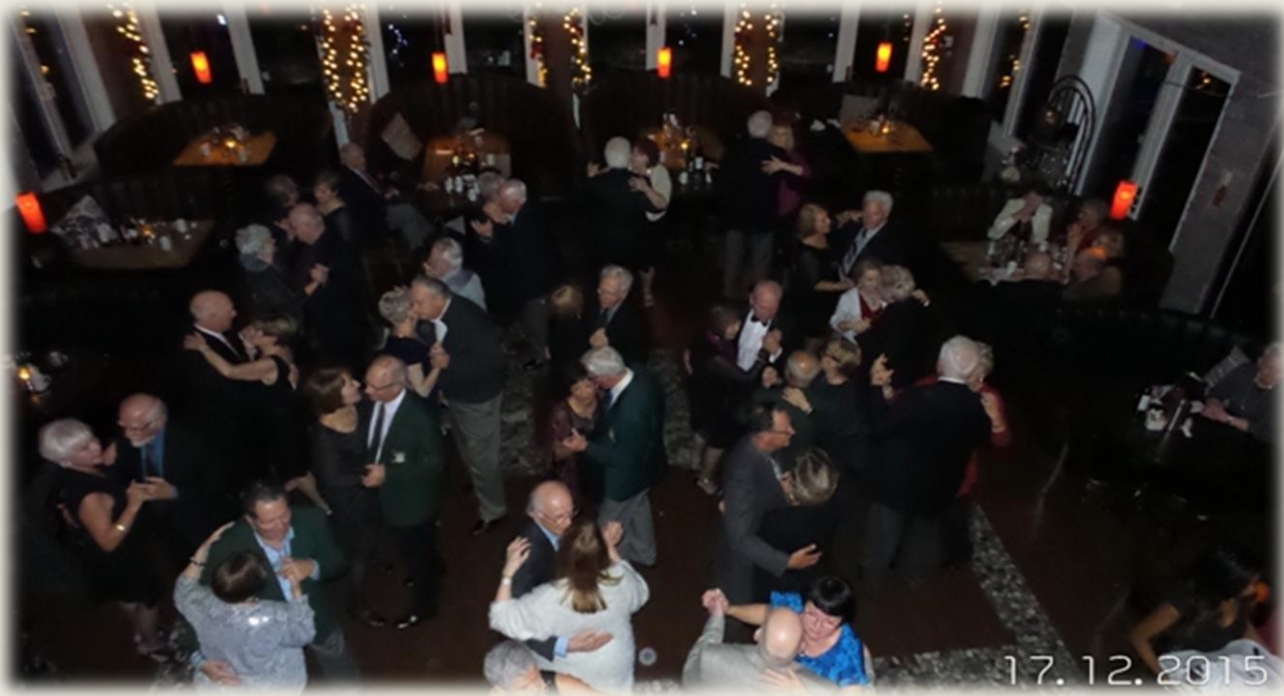
Country Meadows Senior Men's Golf Club