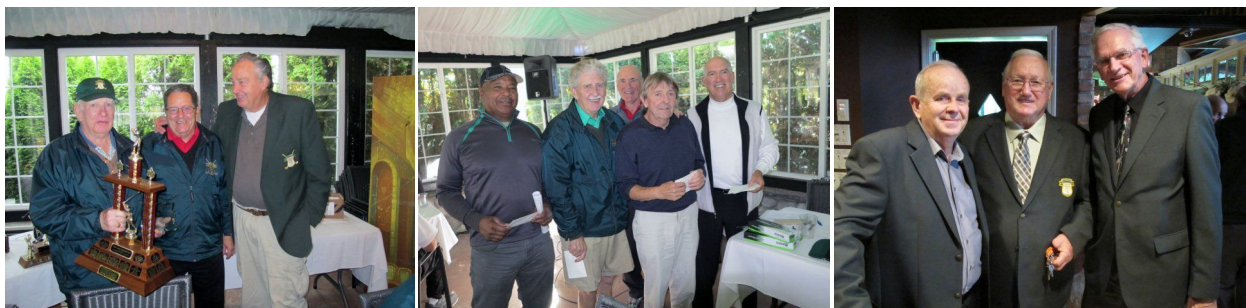
Gentlemen of the Club enjoying the Club House