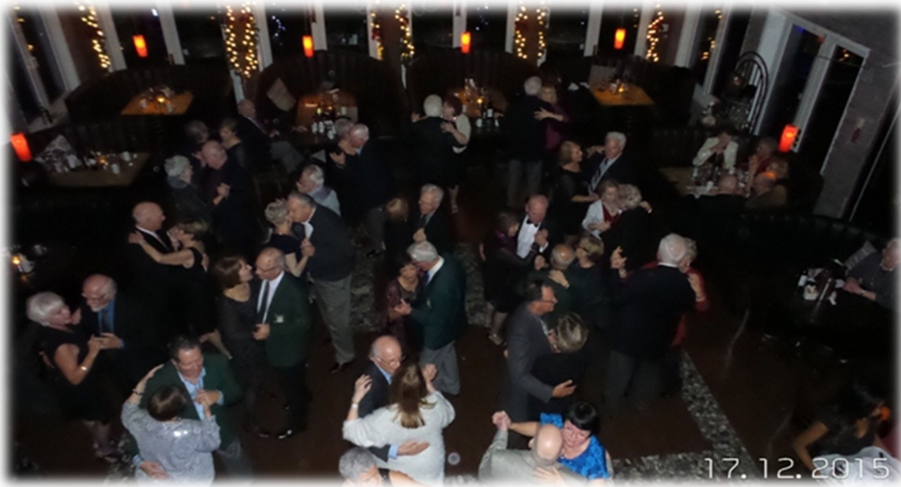
Country Meadows Senior Men's Golf Club